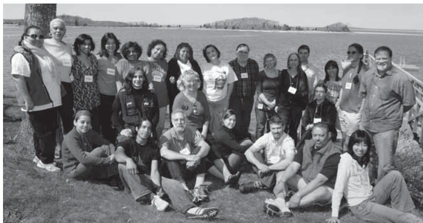
Spring Training of Trainers participants and instructors gather for a group photo on Buzzards Bay, MA.